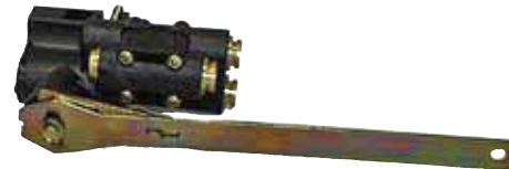
NGHCV DUMP (neutral position)