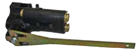
NGHCV NON-DUMP (neutral position)