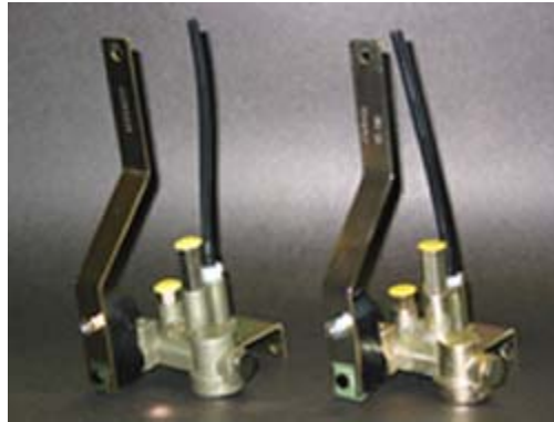
These two parts are visually alike but one is a counterfeit. Which one? (See page 3 for answer)

Do you want to risk thousands of dollars of damage to your systems?